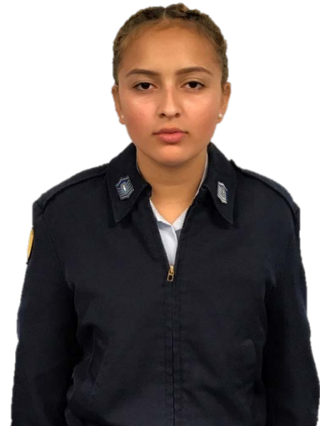
Lightweight Blue Jacket

RANK: Mandatory—worn on both the right and left collar, centered from left to right, parallel with the outer edge of the collar, and 1 inch from the bottom of the collar. Rank must also be worn on the blue shirt.