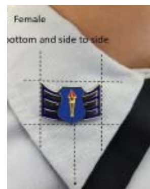
Enlisted Rank Placement