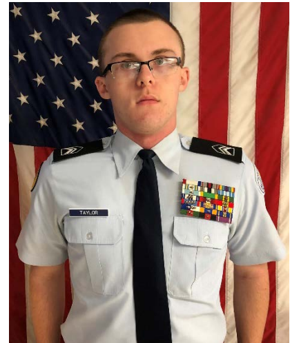
Option B (Male)