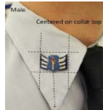
Enlisted Rank Placement