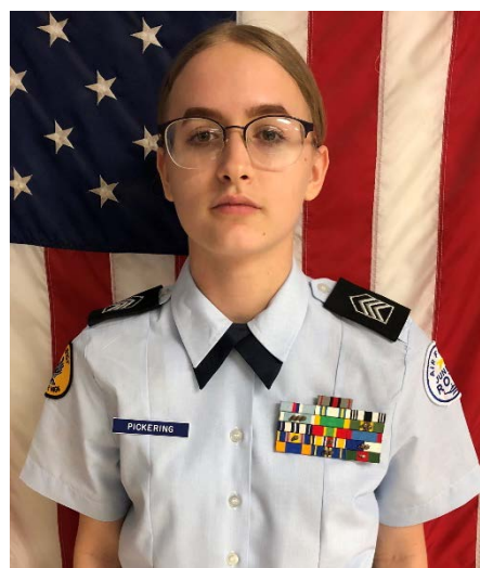
Option B (Female)