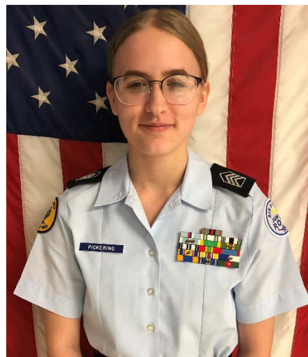
Option A (Female)

T-SHIRT: If worn, must be plain, white, V-neck or tank style.