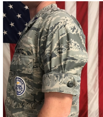
Proper Sleeve Roll